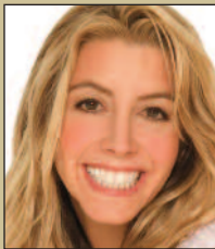
Sara Blakely Founder Spanx