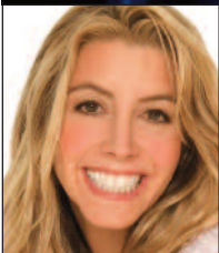
Sara Blakely Founder Spanx